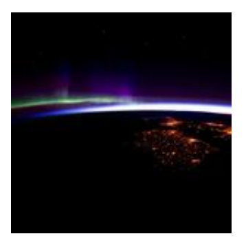
Meta-Geopolitics: the Relevance of Geopolitics in the Digital Age