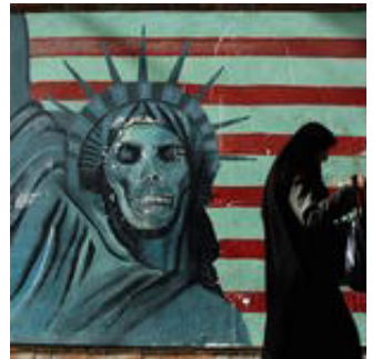
Review Feature -Understanding Iran: A Summary of Recent Scholarship