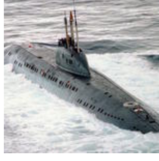
Strangers in the Archipelago: Hunting for 'Something' in Swedish Waters